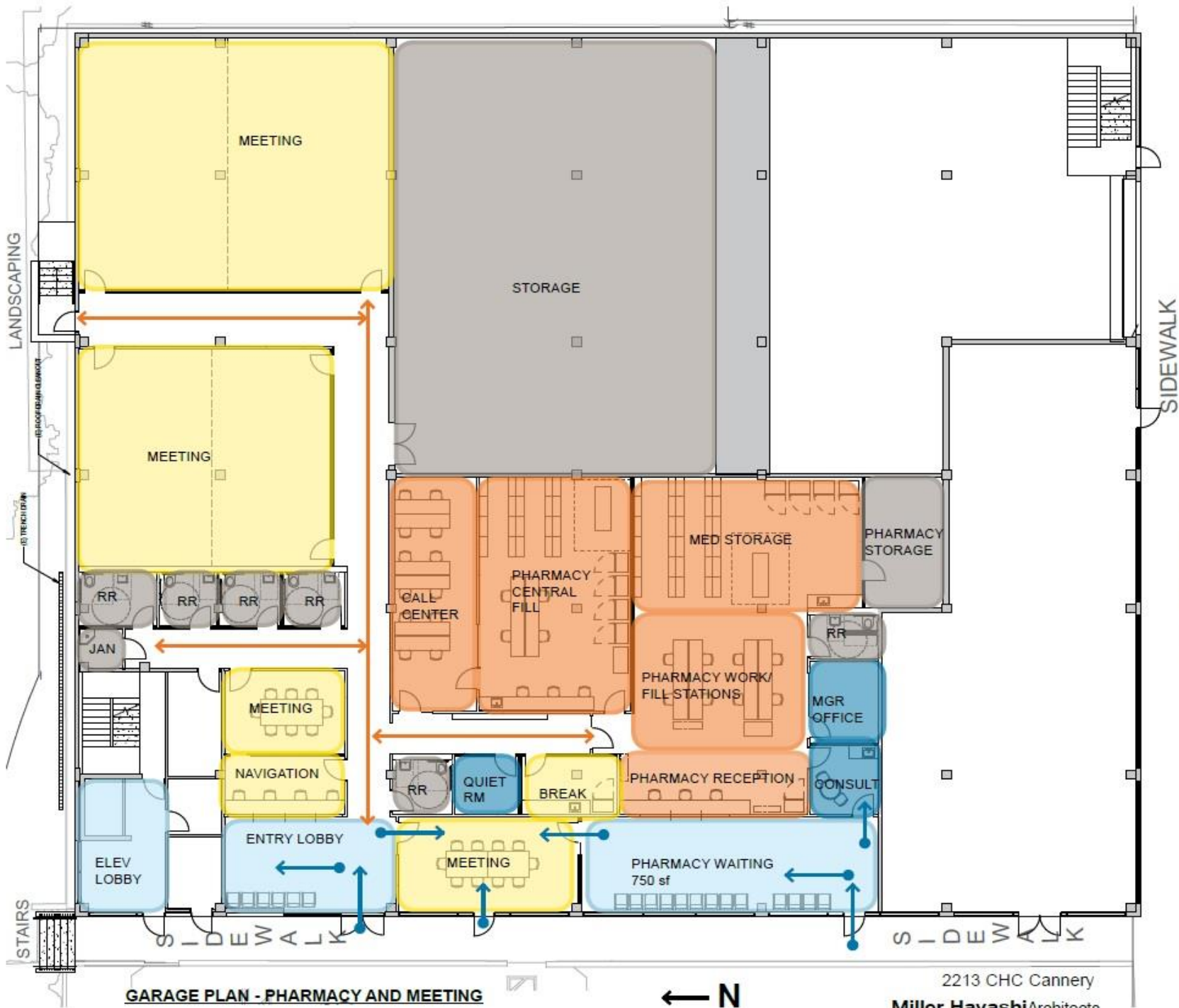
GARAGE PLAN - PHARMACY AND MEETING